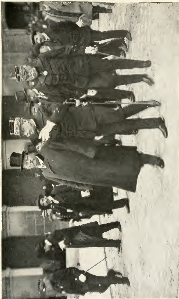
THEODORE ROOSEVELT, 1910 In Paris on his return from Africa